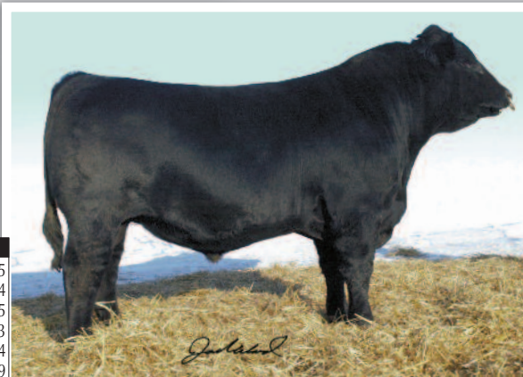
HOOKS PACESETTER 8P