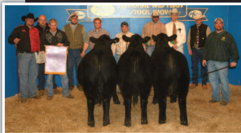
Reserve Grand Champion Pen of 3 Percentage Simmental Bulls 2009 National Western Stock Show