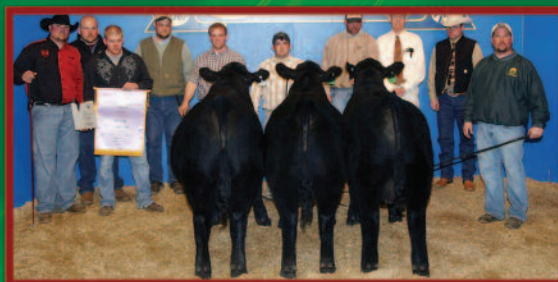
RESERVE GRAND CHAMPION PEN OF THREE PERCENTAGE BULLS 2009 National Western Stock Show

SATURDAY, FEBRUARY 13, 2010 12 Noon Sharp!