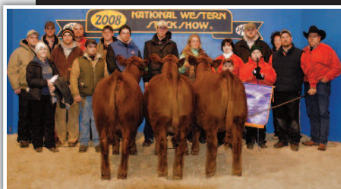
Grand Champion Pen of 3 Simmental Heifers 2008 National Western Stock Show