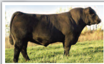
B C MARATHON 7022

Black Dbl Pld 1/2 SM 1/2 AN ASA#2502945 BD: 3-6-09 Tattoo: W135 BW: 90 Adj. WW: