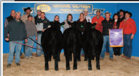
Grand Champion Pen of 3 Percentage Simmental Heifers 2009 National Western Stock Show

GUEST BREEDERS: Lunning Bros. Simmental 507-324-5516 Golly Farms 507-399-9542 • Four Winds Angus 507-273-2653