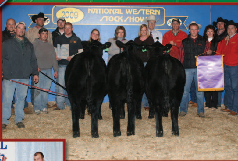
GRAND CHAMPION PEN OF THREE PERCENTAGE HEIFERS 2009 National Western Stock Show

With Guest Breeders: Golly Farms, Four Winds Angus & Lunning Brothers Simmental