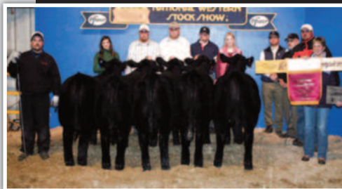
Reserve Grand Champion Pen of 5 Simmental Bulls 2006 National Western Stock Show