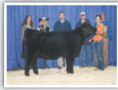
2009 NORTH STAR CLASSIC CHAMPION HEIFER