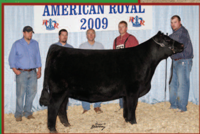
GLS/GF MISS FRONTIER U30 2009 AJSA North Central Classic & 2009 Iowa State Fair Champion Percentage Female