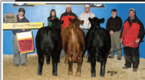
Reserve Grand Champion Pen of 3 Percentage Simmental Bulls 2006 National Western Stock Show