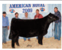
GLS/GF MISS FRONTIER U30

This bull is a 1/2 brother to Hunter Aggen's "Shorty" heifer that won several shows this past year. Warrior is a very stout, very sound bull with tons of rib shape and capacity. This young stud will make great replacement females as well as bull prospects. This bull's dam has never missed in three calves. Predictability is bred into this great herd sire.