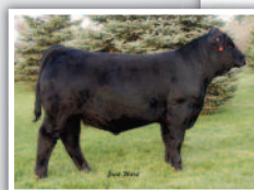
GLS UNMATCHED U62 MATERNAL BROTHER SOLD TO EICHACKER SIM