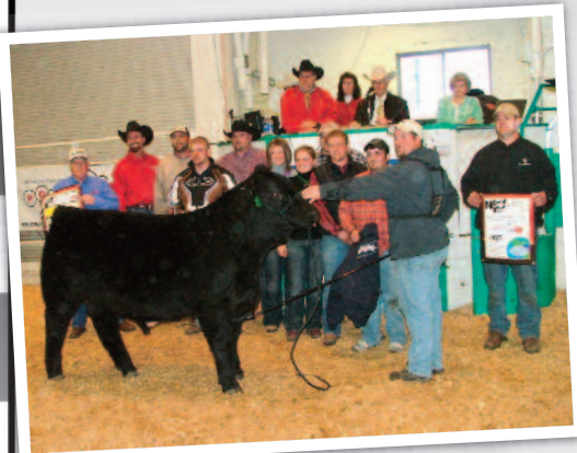
CATTLE WITH "MILE-HIGH" POTENTIAL The Grass-Lunning/Golly Farms crew with their 2009 National Western Stock Show "Power Bull" People's Choice Champion Bull

Grass-Lunning Simmentals is an Accredited Tuberculosis (TB) Free Herd!