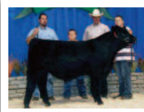
2009 MN STATE FAIR CHAMPION

This Frontier son is a true powerhouse. This bull has been a standout since birth. He was named Champion Simmental Bull at the MN State Fair in September. If you are looking for a bull to add style and performance to your calves, U21 would be a good choice.